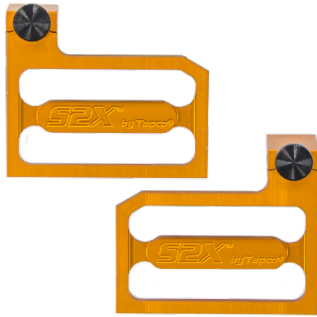
Material Stop (2)