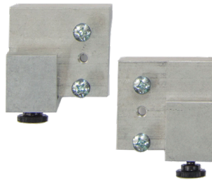
Width Adjuster Assembly (2)