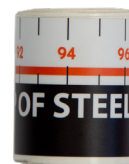
126" Centering Tape (1)