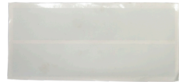
Laminate Stickers (2)